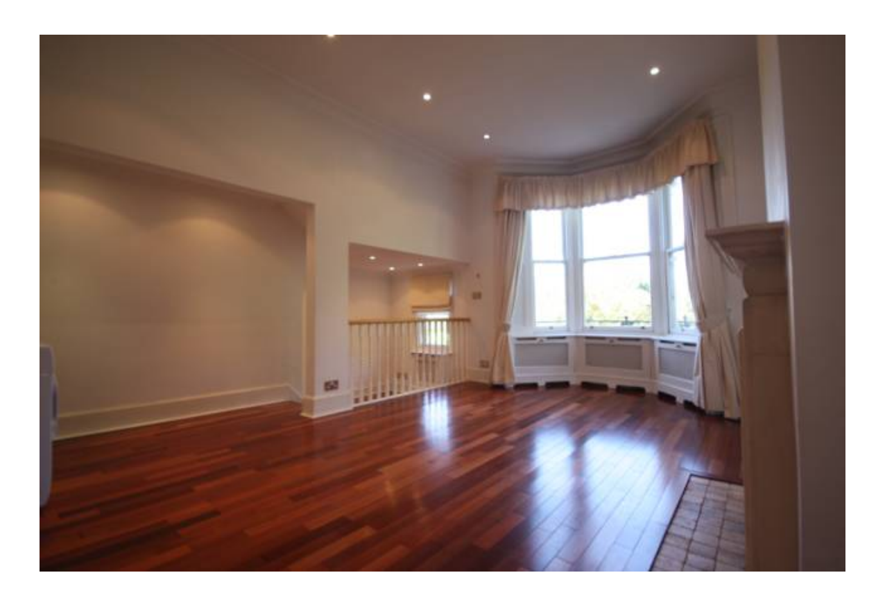
£1,150 Per Week

We are pleased to offer this fantastic three double bedroom maisonette apartment with stunning views of Hampstead Heath and the ponds. With three double bedrooms, two bathrooms and separate Guest WC, this apartment is within easy reach of tube, rail and road links and a five-minute walk to Hampstead Village.