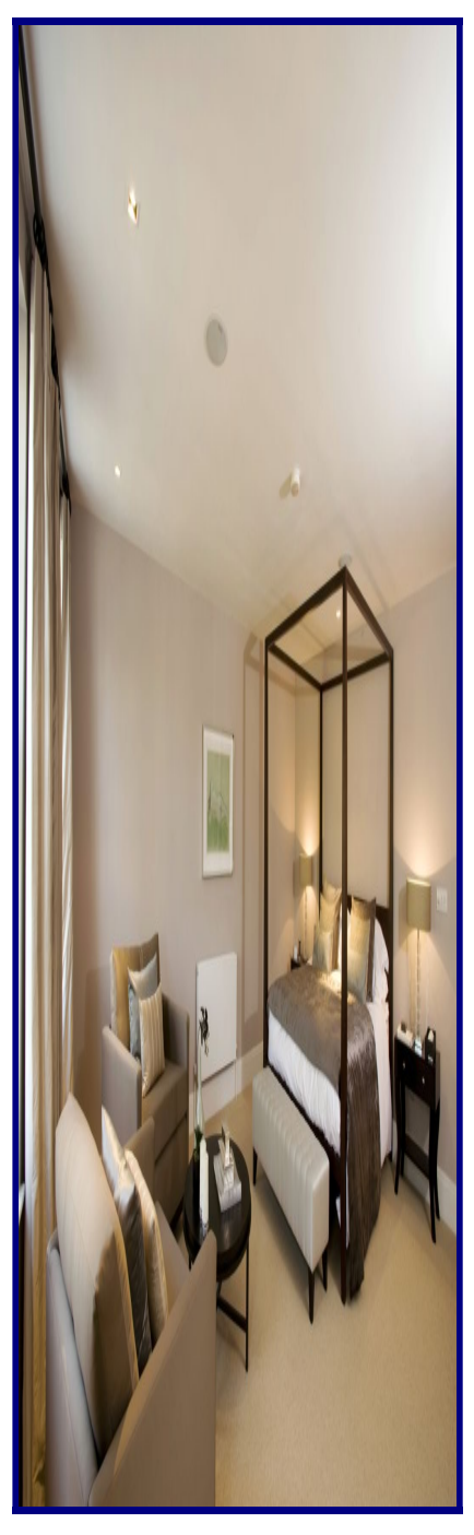
General: While we endeavor to make our sales particulars fair, accurate and reliable, they are only a general guide to the property and, accordingly, if there is any point which is of particular importance to you, please contact the office and we will be pleased to check the position for you, especially if you are contemplating traveling some distance to view the property. Measurements: These approximate room sizes are only intended as general guidance. You must verify the dimensions carefully before ordering carpets or any built-in furniture. Services: Please note we have not tested the services or any of the equipment or appliances in this property, accordingly we strongly advise prospective buyers to commission their own survey or service reports before finalizing their offer to purchase. THESE PARTICULARS ARE ISSUED IN GOOD FAITH BUT DO NOT CONSTITUTE REPRESENTATIONS OF FACT OR FORM PART OF ANY OFFER OR CONTRACT. THE MATTERS REFERRED TO IN THESE PARTICULARS SHOULD BE INDEPENDENTLY VERIFIED BY PROSPECTIVE BUYERS OR TENANTS. NEITHER DEMO AGENT 1 NOR ANY OF ITS EMPLOYEES OR AGENTS ANY AUTHORITY TO MAKE OR GIVE ANY REPRESENTATION OR WARRANTY WHATEVER IN RELATION TO THIS PROPERTY. YOUR HOME IS AT RISK IF YOU DO NOT KEEP UP REPAYMENTS ON A MORTGAGE OR OTHER LOAN SECURED ON IT. Written quotations available on request. All loans secured on property. Life assurance is usually required.