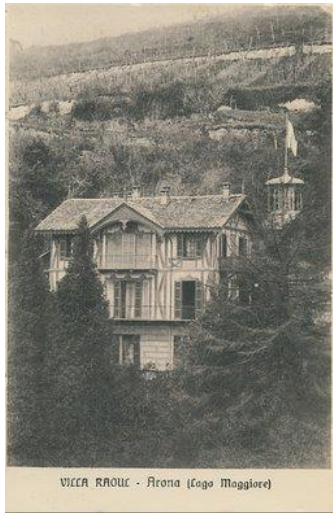
VILLA RAUZI - Airona (Lago Maggiore)