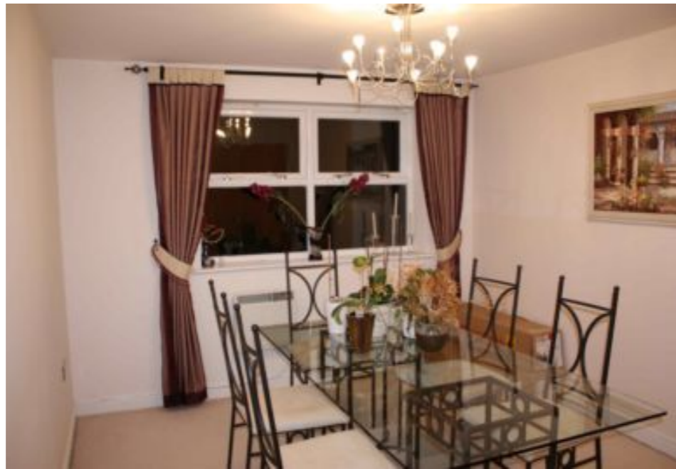
Cockfosters Road, Cockfosters, EN4