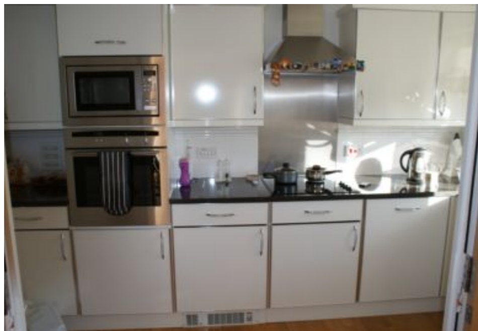
Cockfosters Road, Cockfosters, EN4