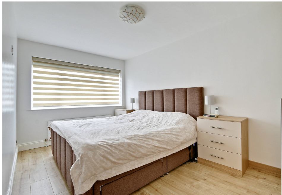
Vernon Crescent, Cockfosters, EN4