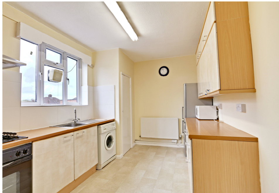
Station Parade, Cockfosters Road, EN4