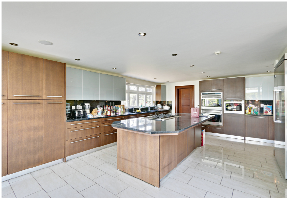
Clay Hill, Enfield, EN2