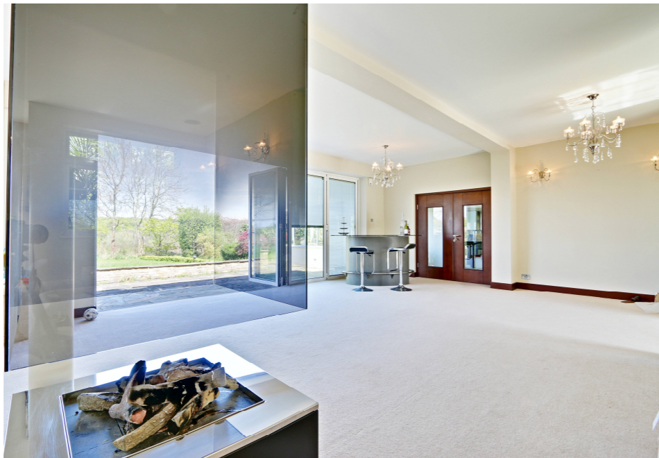
Clay Hill, Enfield, EN2