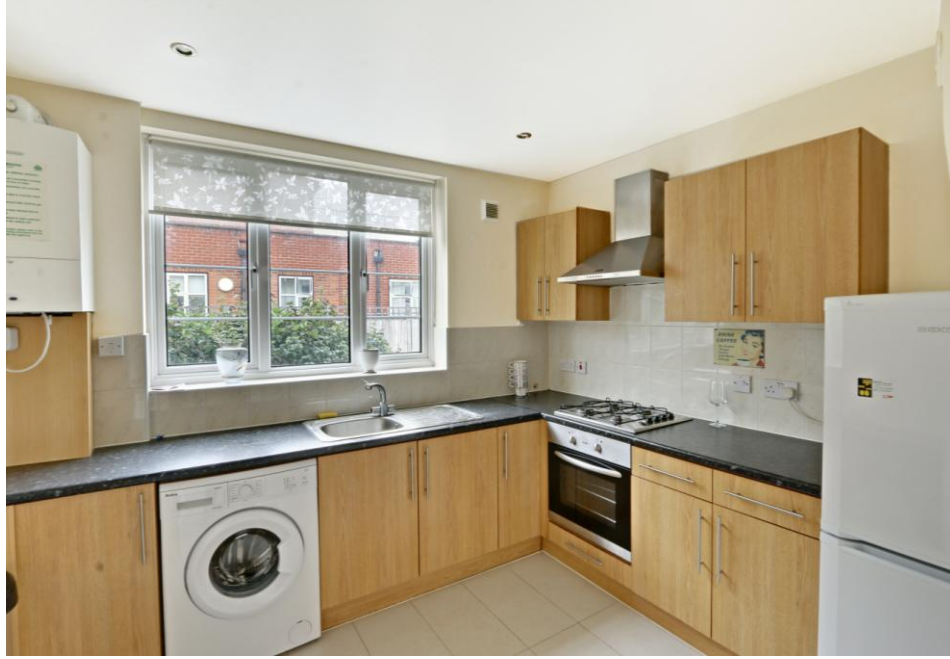
The Orchard, Oakwood, N14