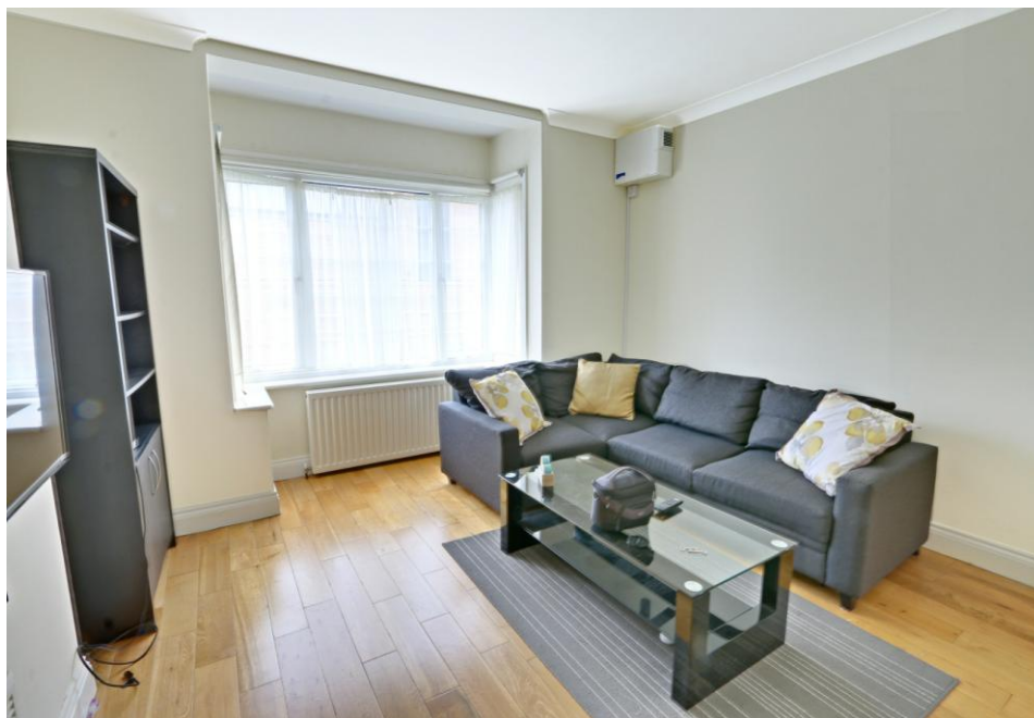
The Orchard, Oakwood, N14