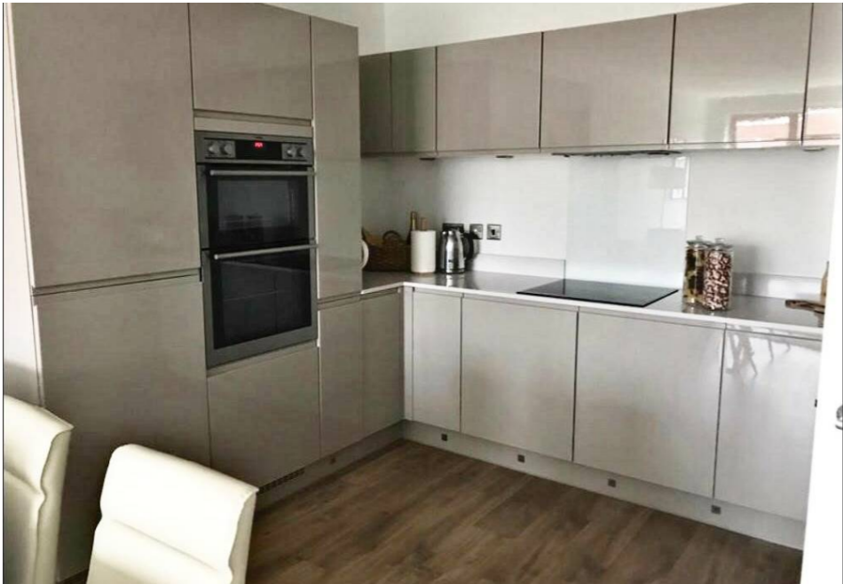
Ebony Crescent, Cockfosters, EN4