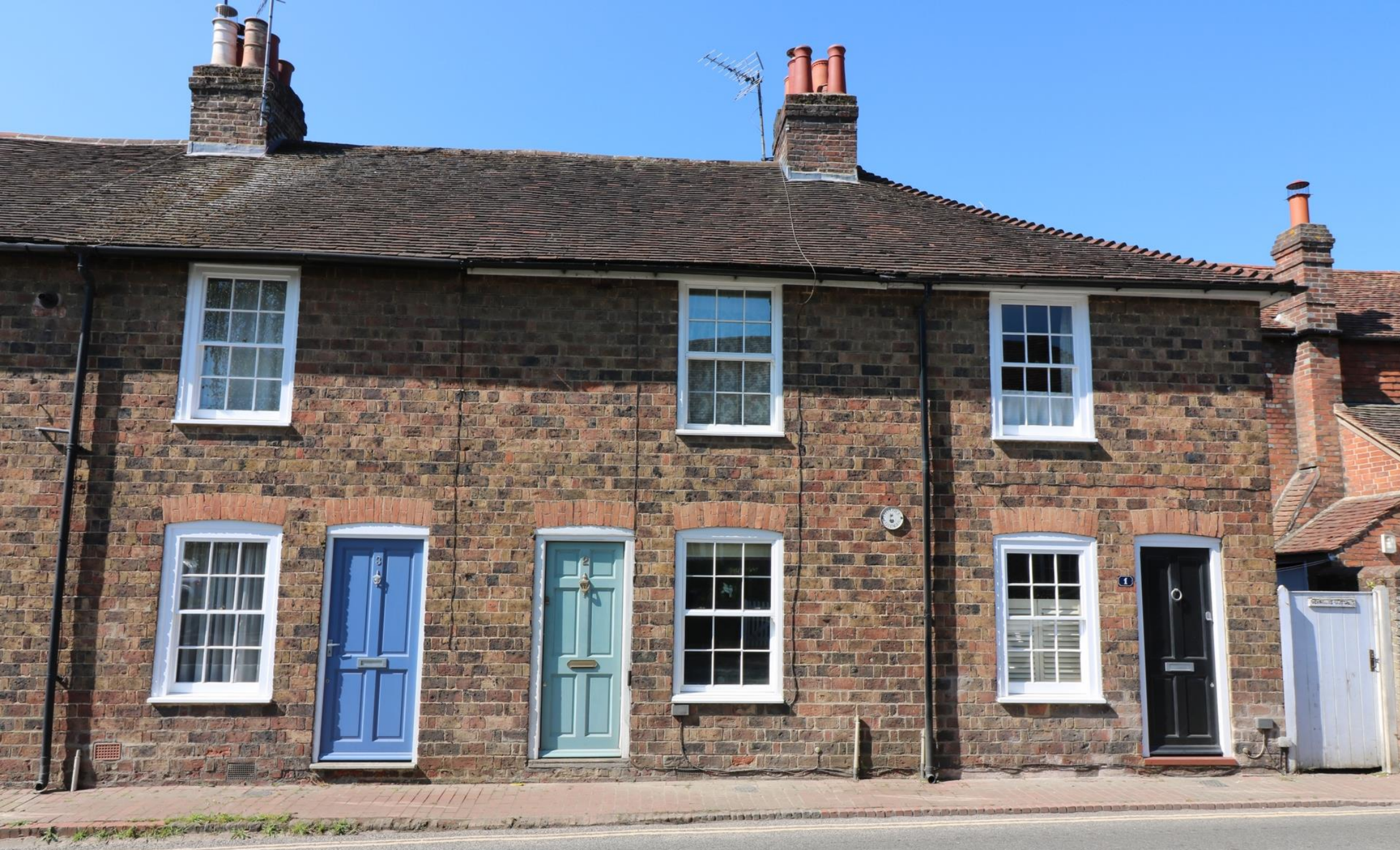
Frederick Cottages Lewes Road, Lindfield, West Sussex, RH16 2