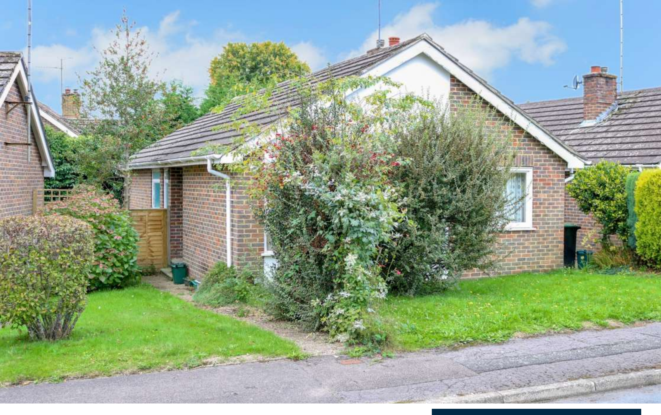
3 Barrington Road Lindfield, West Sussex, RH16 2NP