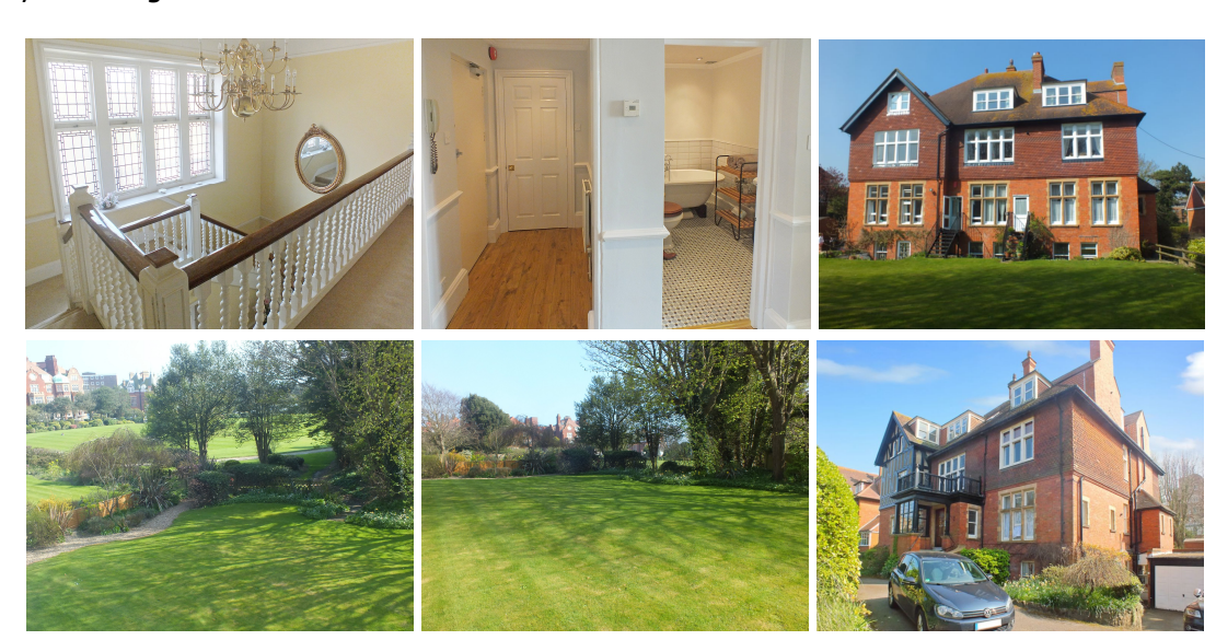
Ground Floor Floor Size: 88.8 m², 956.3 ft²