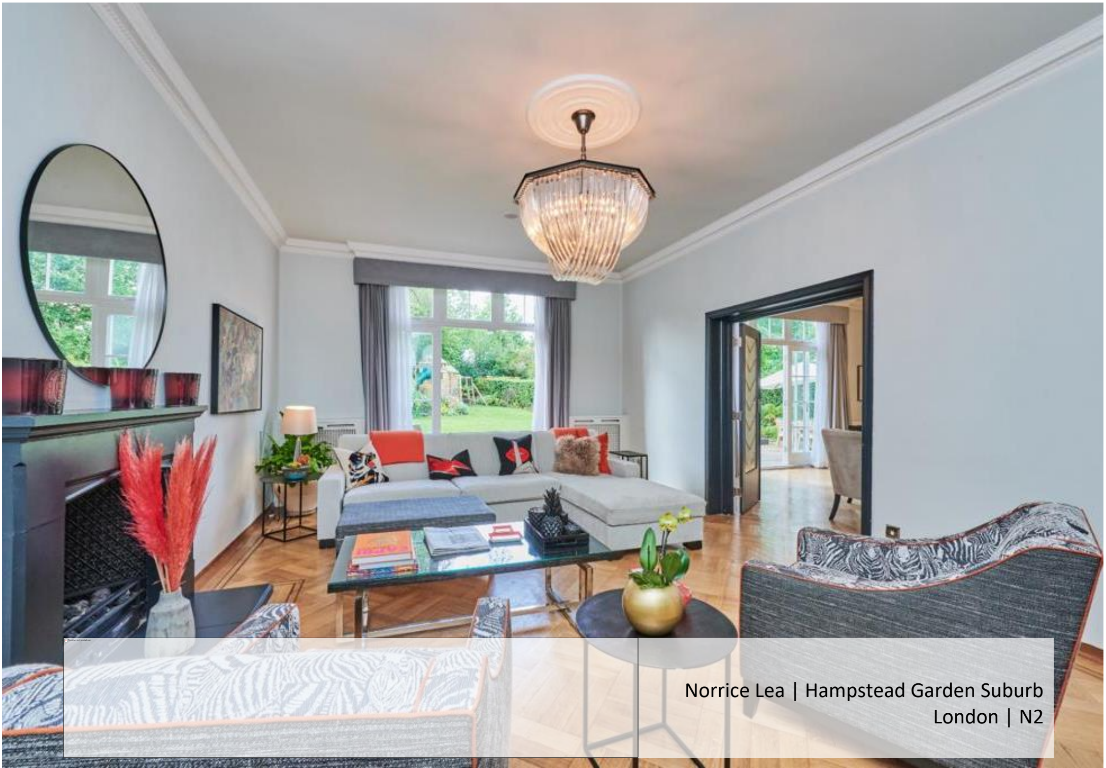
Norrice Lea | Hampstead Garden Suburb London | N2