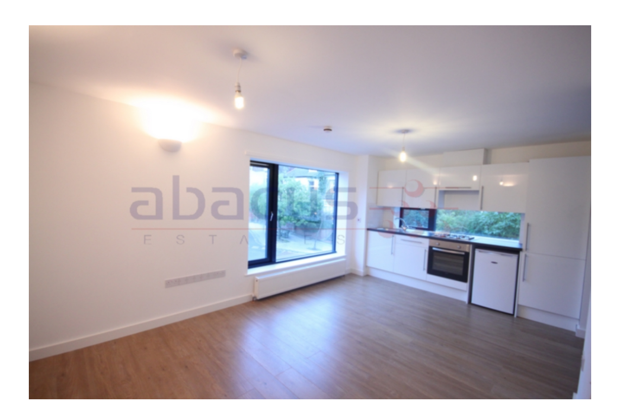
£295 Per Week

A newly refurbished studio/one bedroom apartment situated in the heart of Mill Lane close to all its local shops and amenities. The property has been refurbished to a high standard offering a large living room with separate sleeping area, modern bathroom and a laundry room. The property benefits from wooden floors and lots of light. Available now