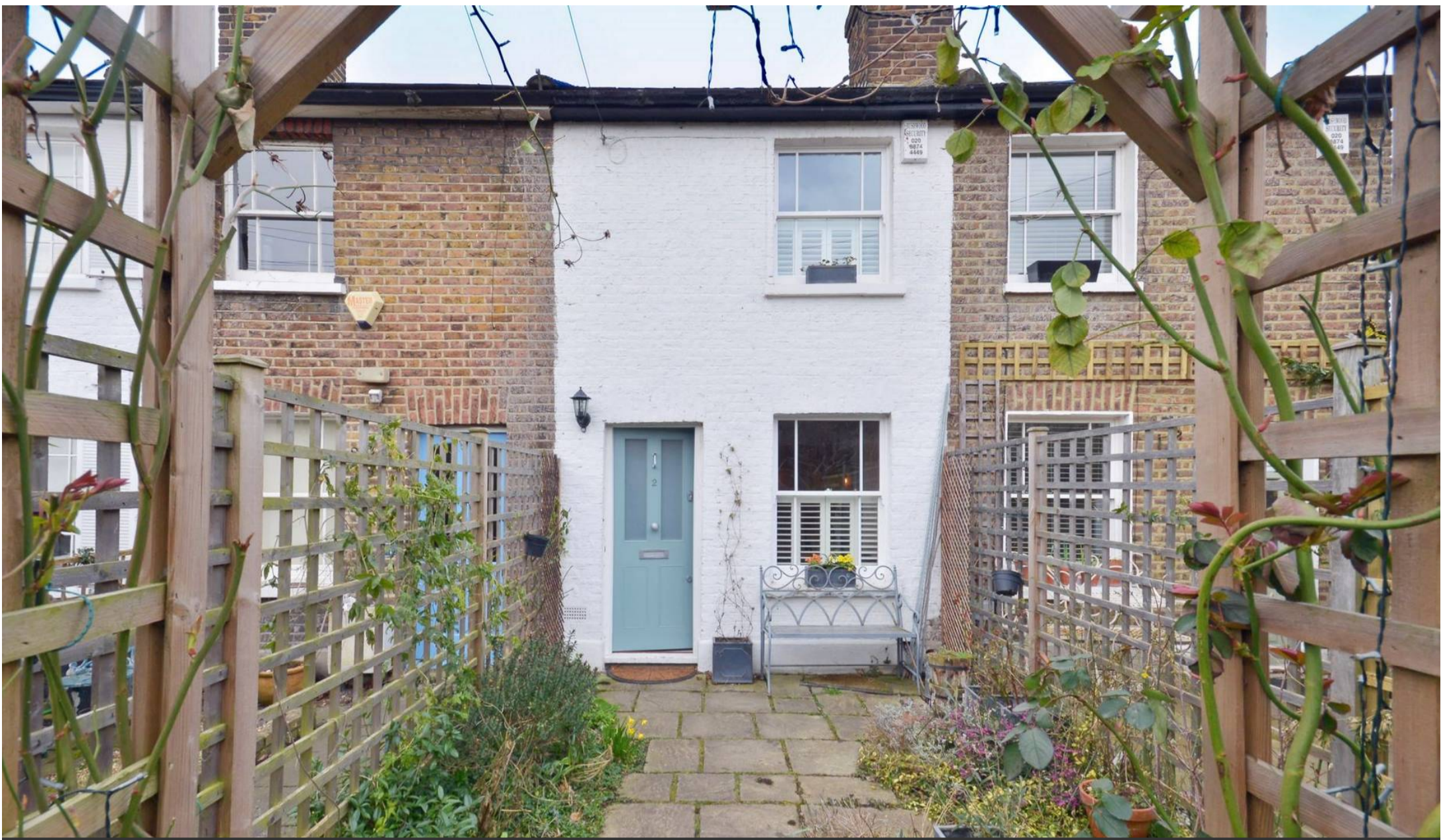
Thorne Passage, Barnes, London, SW13

Thorne Passage, Barnes, London, SW13 £2,750 per month