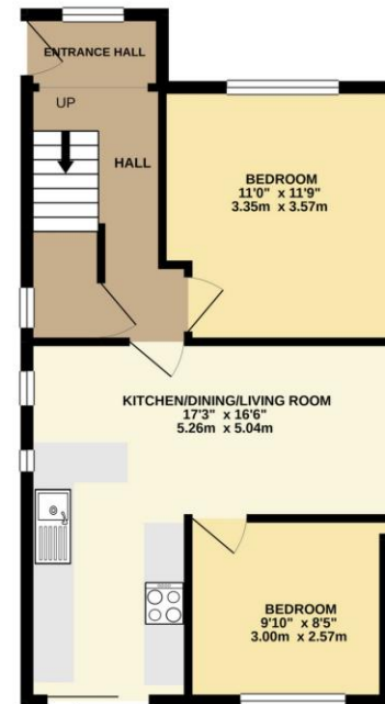
GROUND FLOOR 502 sq.ft. (46.6 sq.m.) approx.