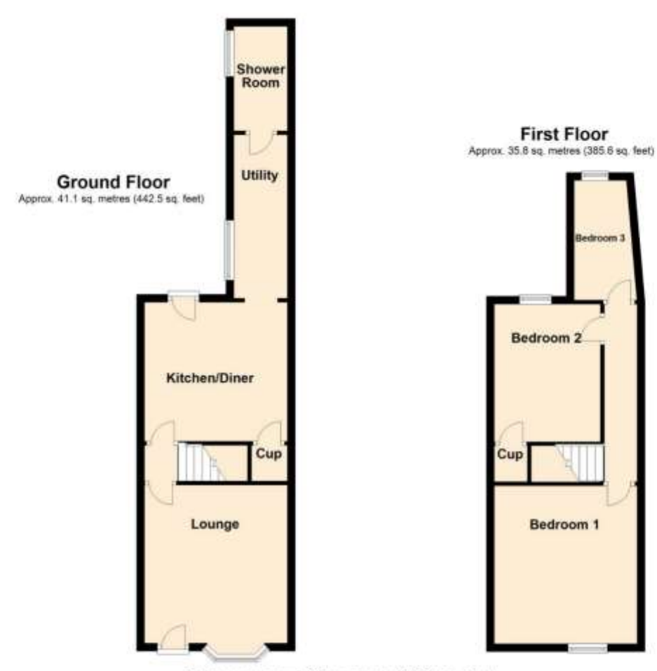
Total area: approx, 76.9 sq. metres (828.1 sq. feet) Please note - these are not to scale For display purposes only Plan produced using Plant/sp.