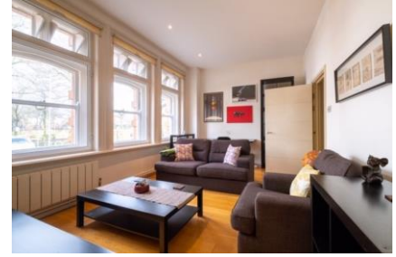
Photo 7 Lounge Area Spacious area for sitting with tall windows to west facing aspect onto Richmond Terrace.

Photo 6 Kitchen / Breakfast Area Good sized modern kitchen with fitted units and integrated appliances. Space for breakfast table and chairs. Door to cupboard containing a gas boiler.