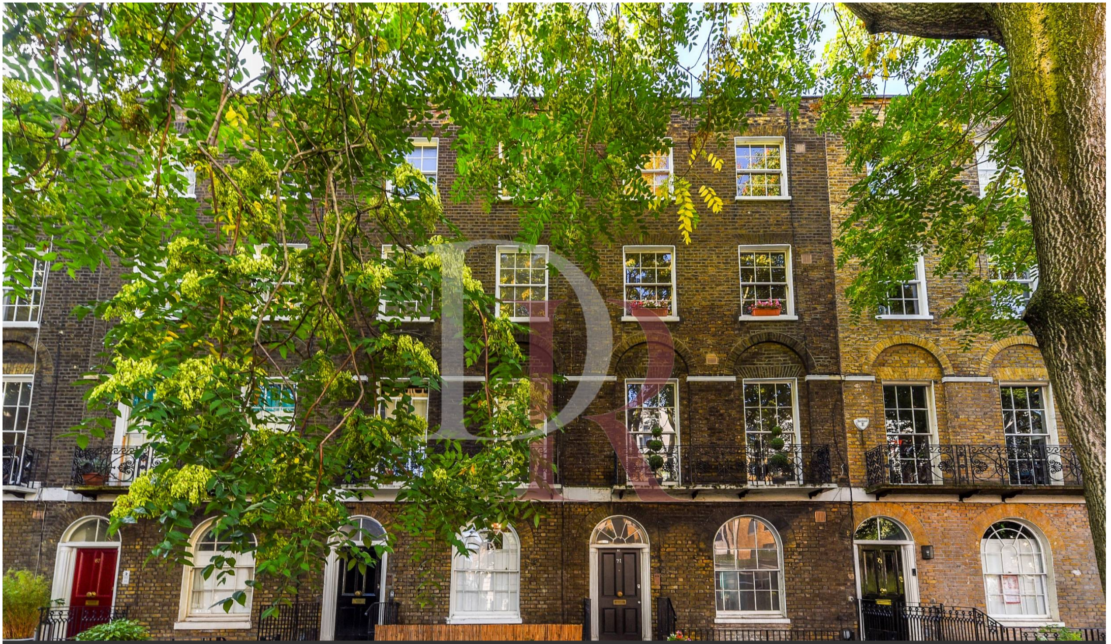
Pentonville Road, Angel, London, N1

Pentonville Road, Angel, London, N1 Asking price of £620,000 Leasehold