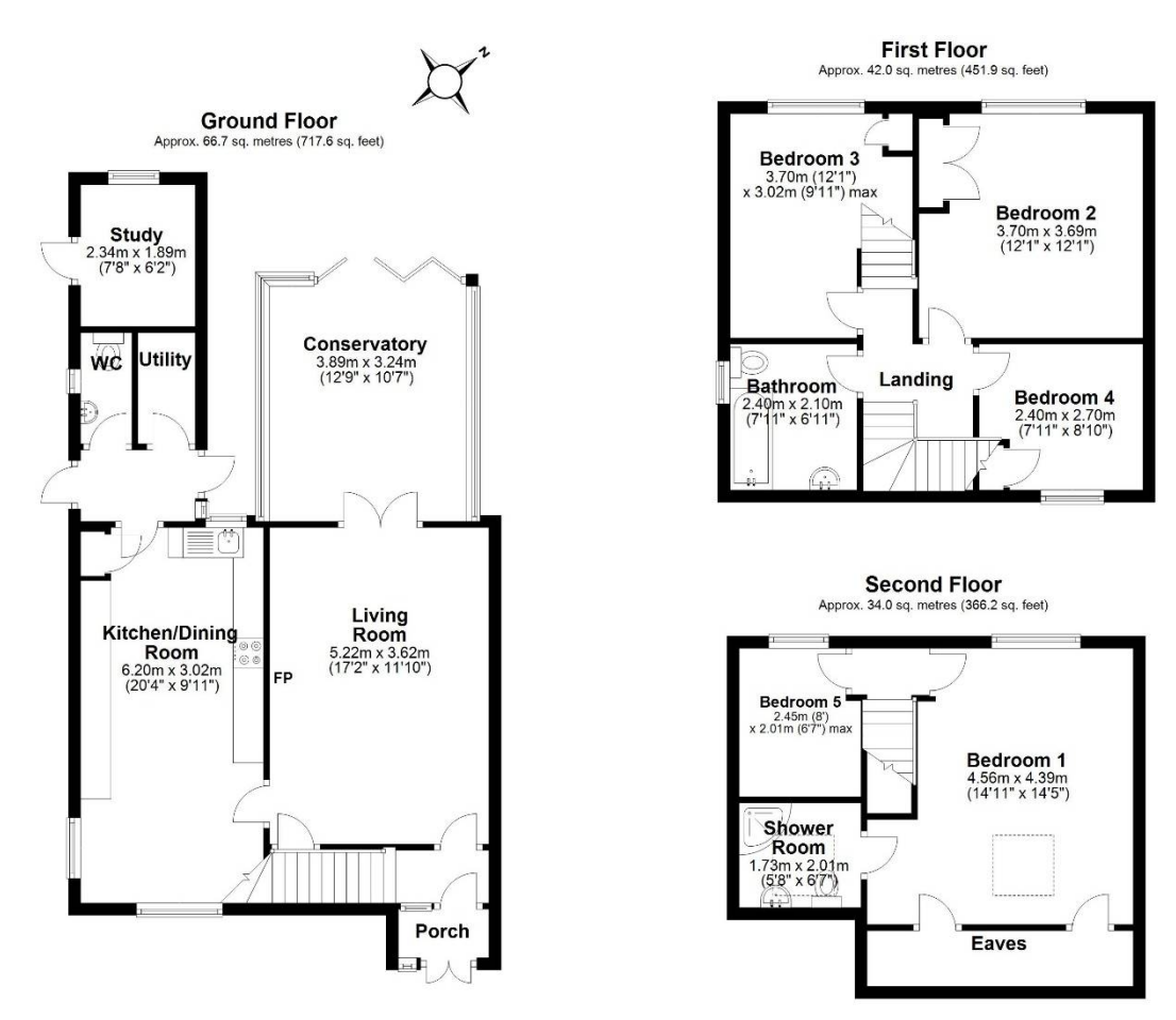
Total area: approx. 142.7 sq. metres (1535.7 sq. feet)