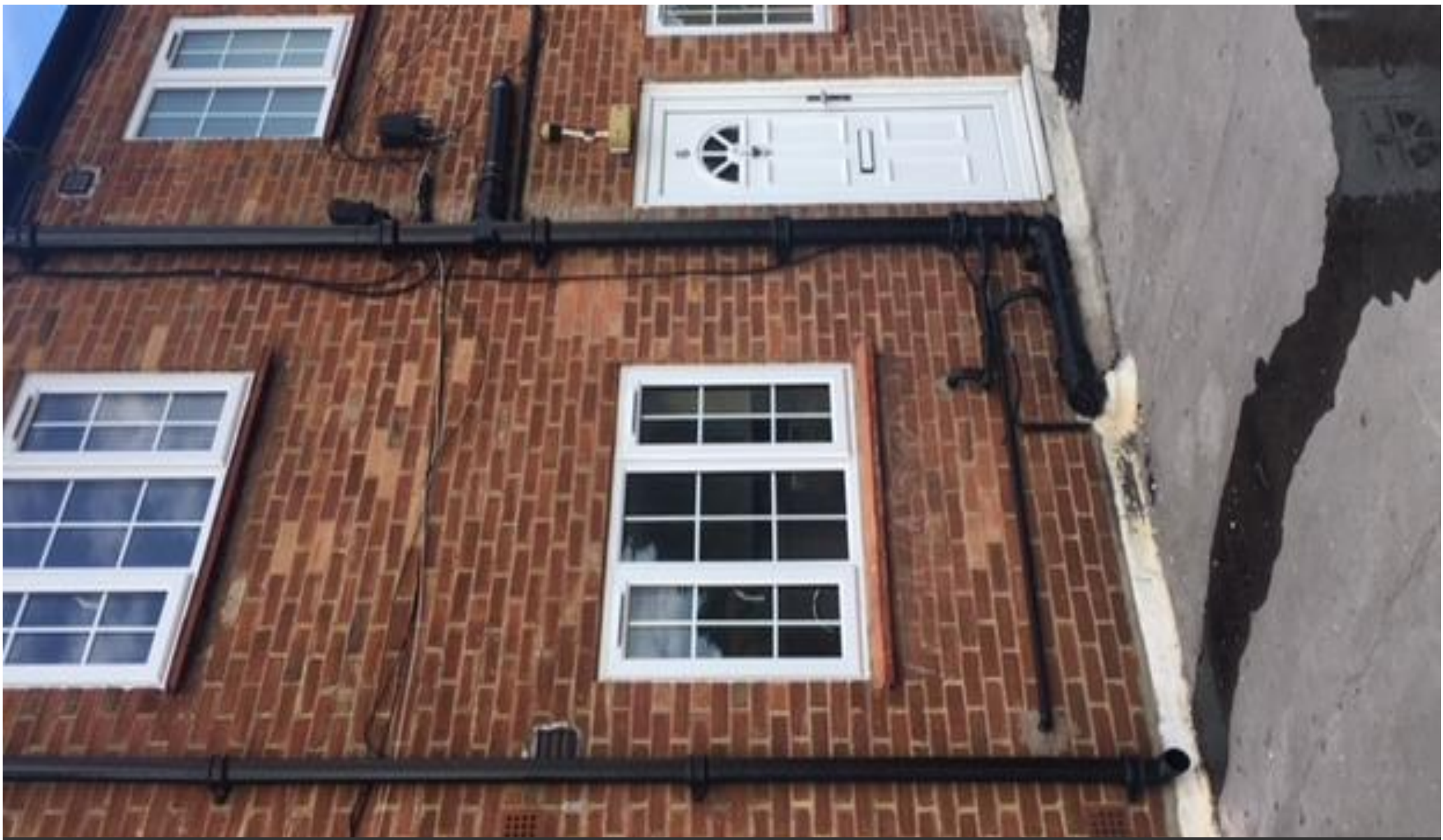
Farmham Road, Slough, London, SL1

Farmham Road, Slough, London, SL1 Asking price of £1,300 per month