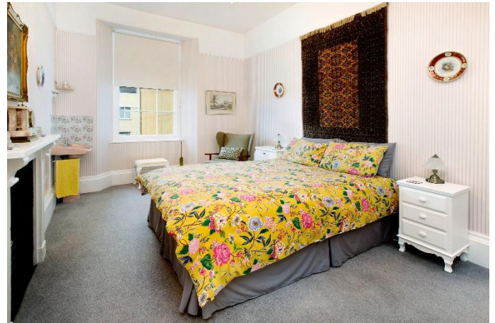
Flat 2 7 Den Crescent First Floor 69.2 sq.m. (745 sq.ft.) approx.