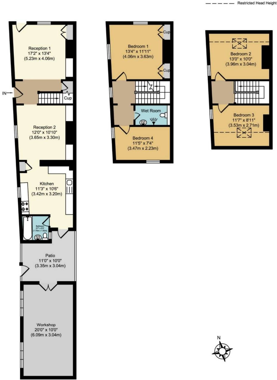
Ground Floor Approximate Floor Area 553.80 sq. ft. (51.45 sq. m)