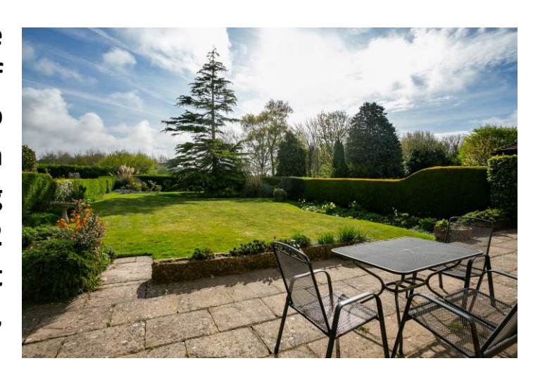
£875,000 Freehold No Onward Chain

www.lawrenceandco.co.uk Tel: 01303 266022 email: findahome@lawrenceandco.co.uk