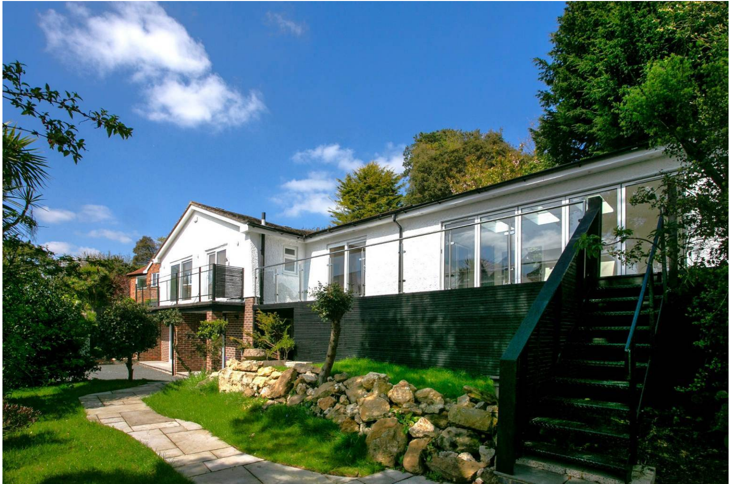
FIG TREE HOUSE, CANNONGATE ROAD, HYTHE