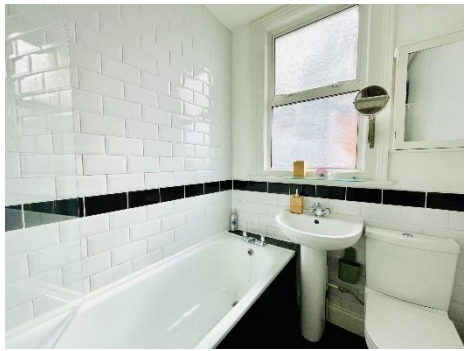
High Road, Willesden Green, NW10