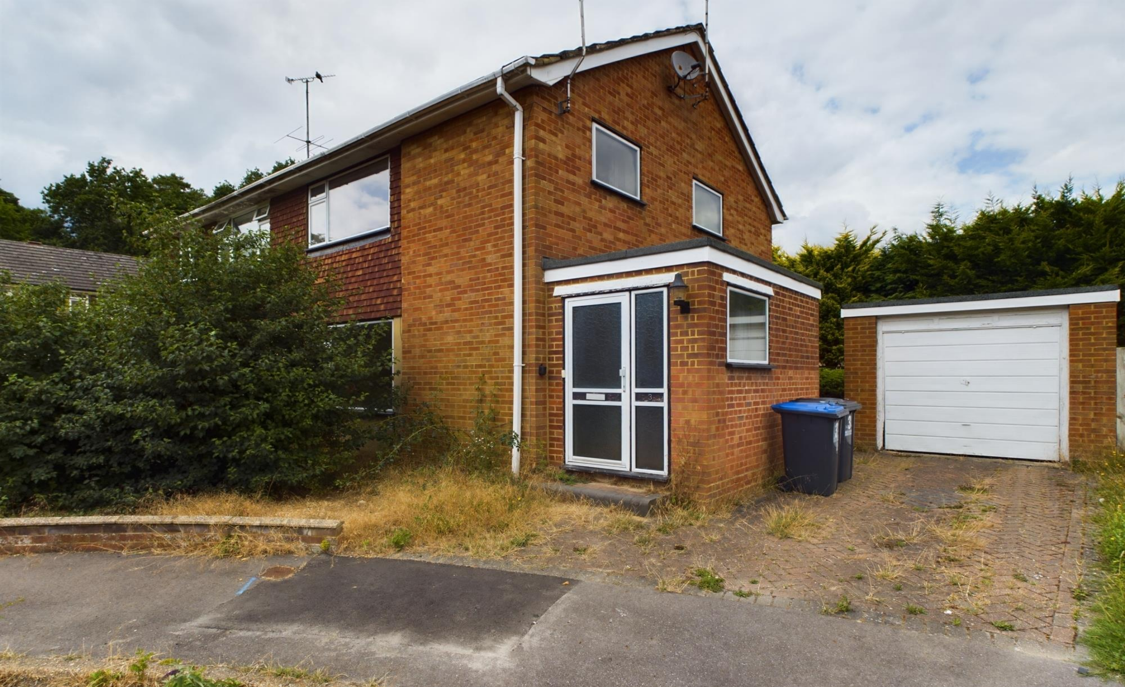
Awbrook Close Scaynes Hill, West Sussex, RH17 7