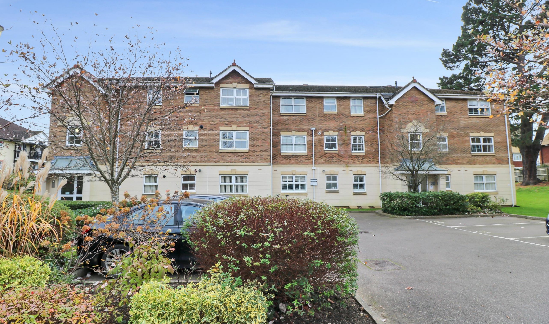
58 Trevelyan Place Heath Road, Haywards Heath, RH16 3AZ