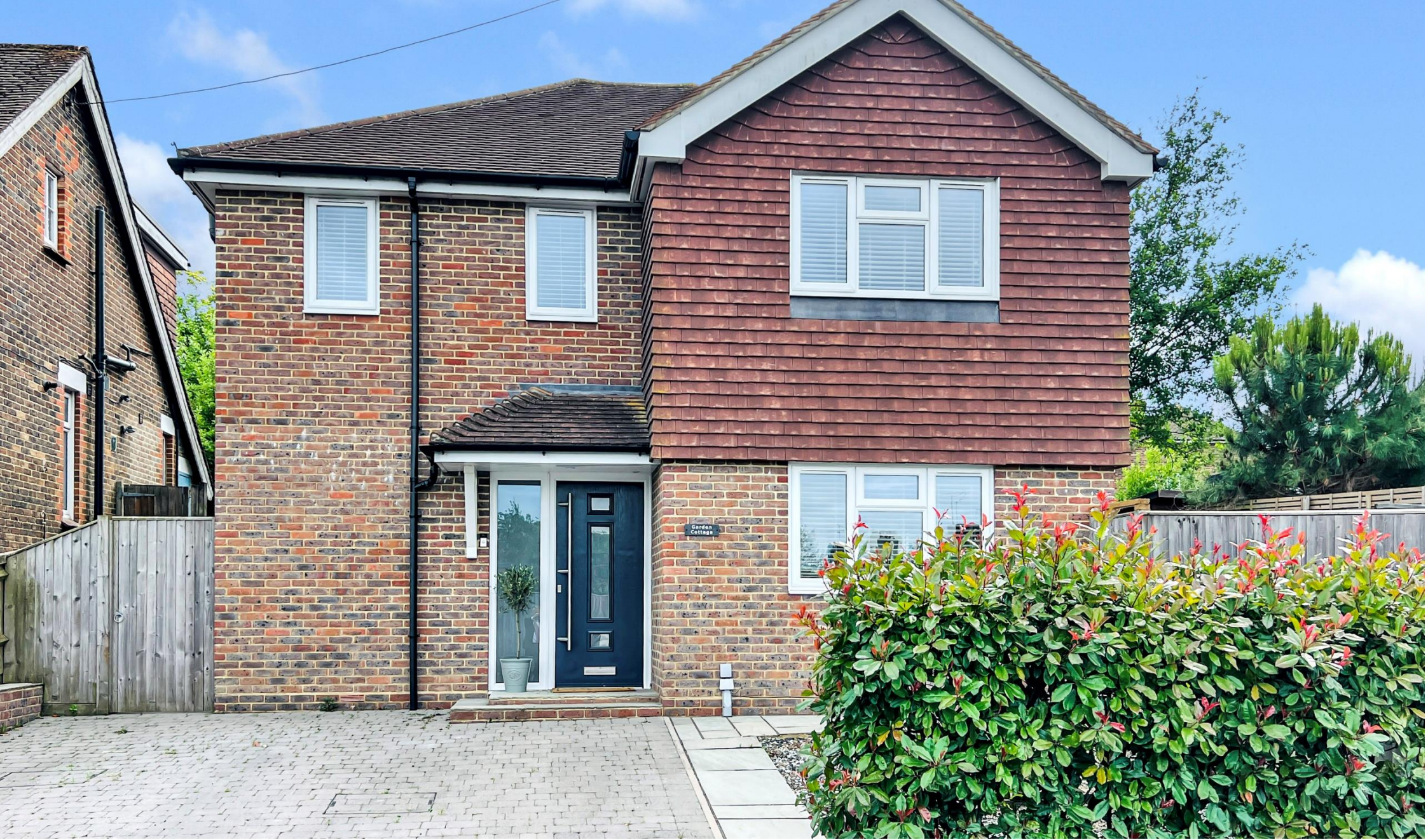
Garden Cottage Oakdale Road, Haywards Heath, RH16 3NE