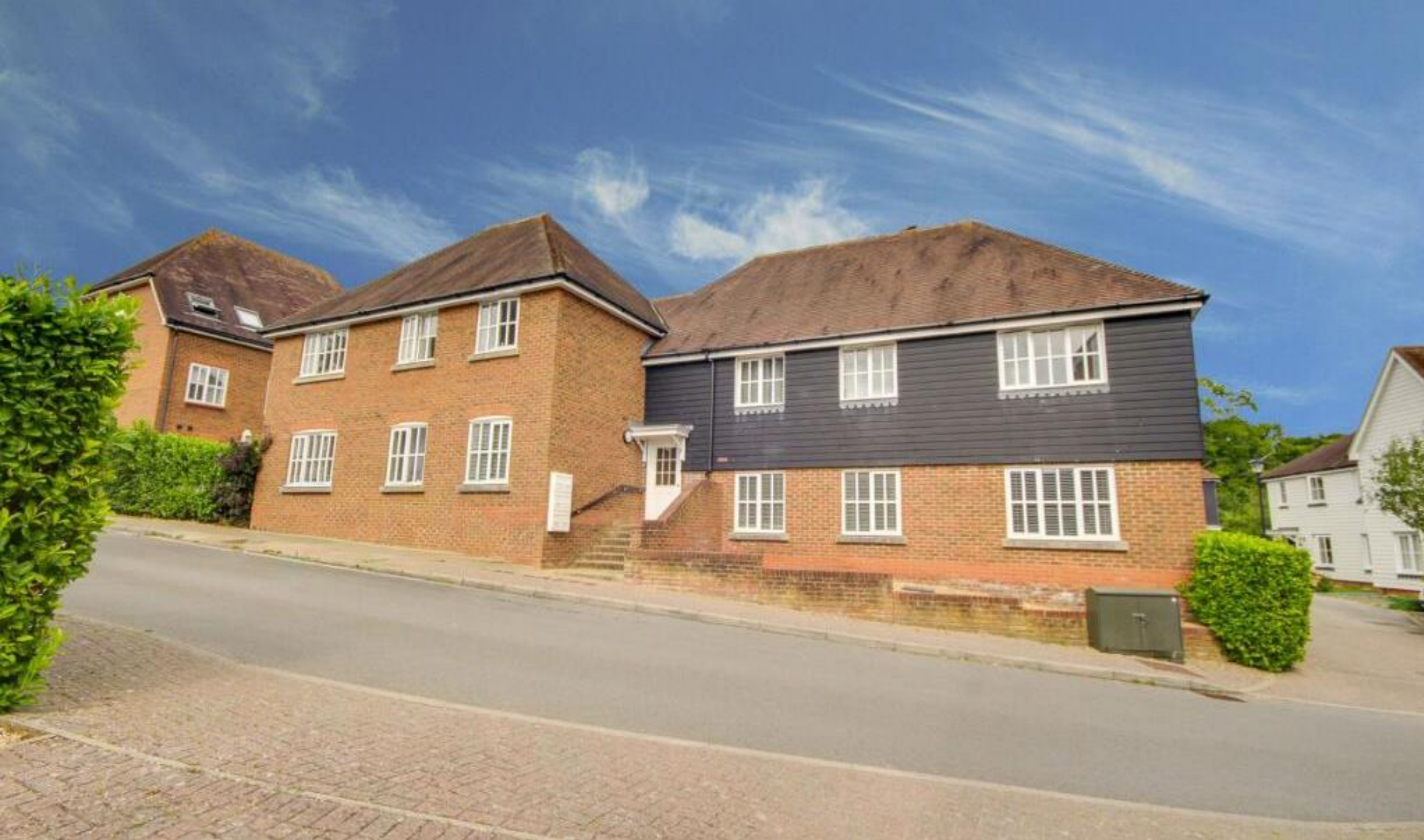
5 Weavers Mead Haywards Heath, RH16 4FR