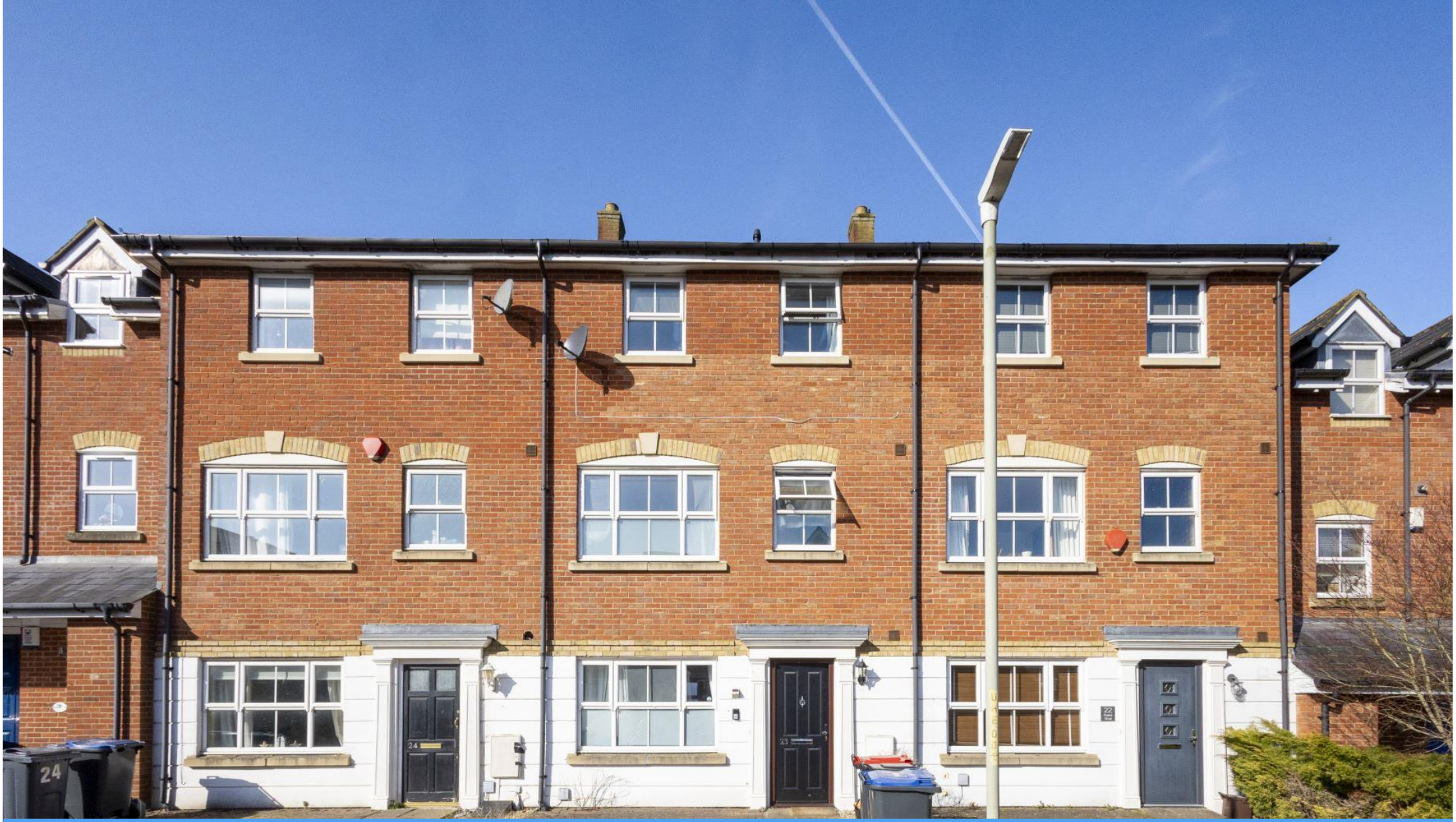
Tower View, Canterbury