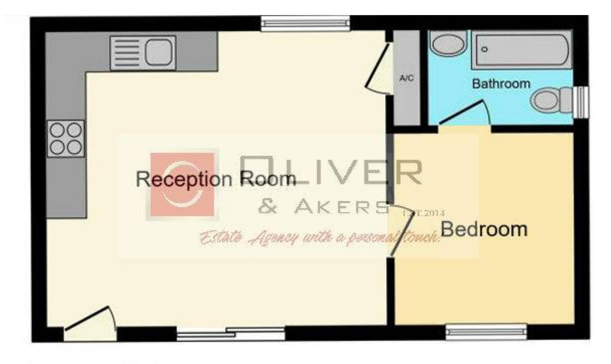
Total floor area 34.1 sg.m. (367 sg.ft.) approx