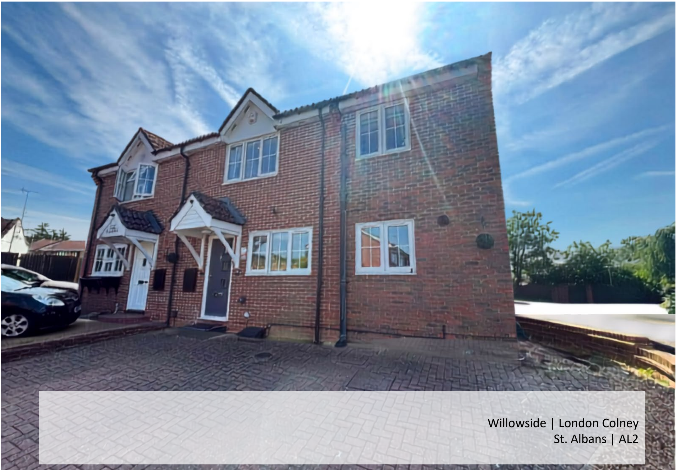
Willowside | London Colney St. Albans | AL2