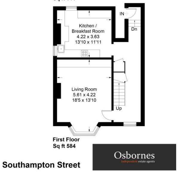
Illustration for identification purposes only, measurements are approximate, not to scale. FloorplansUsketch.com © 2020 (ID664845)