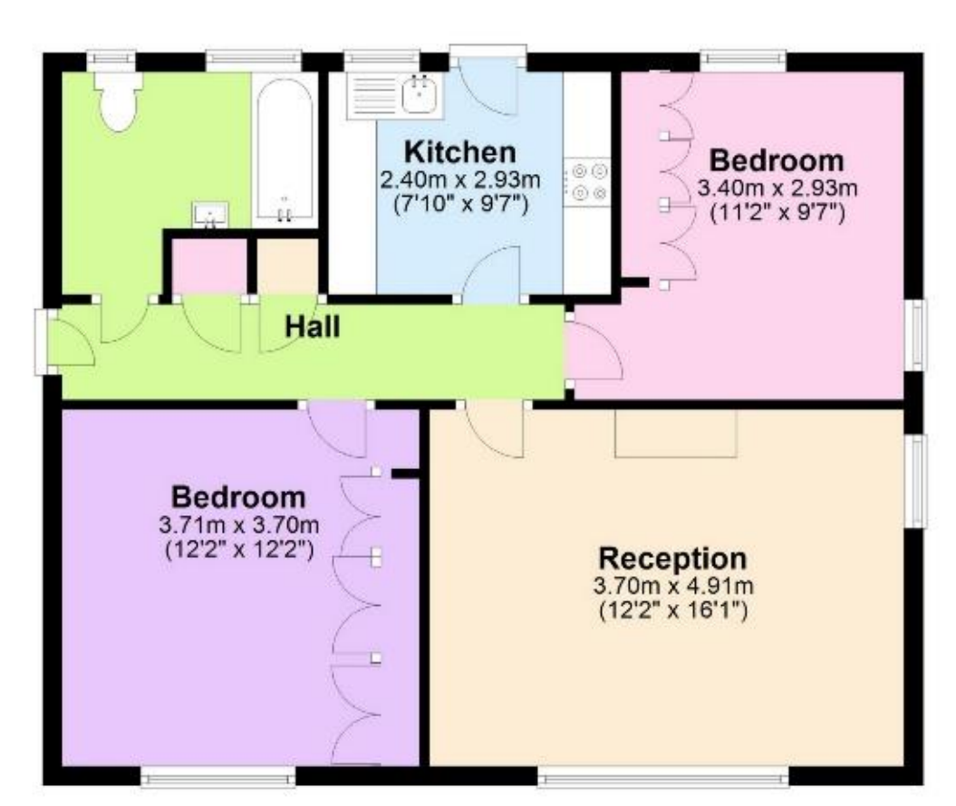
Total area: approx. 62.2 sq. metres (669.5 sq. feet)

The measurements given are approximate and are for illustration only . They should not be relied on for valuation . Plan produced using PlanUp.